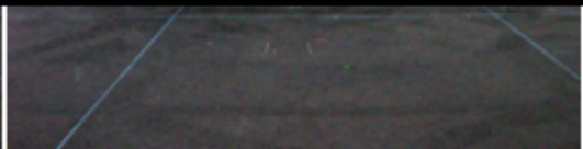
The Cost of Living