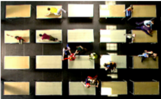
One Flat Thing, Reproduced

Using the newest technology in media to push the boundaries of gravity and stretch our perception of dance and movement, the REDCAT programs present 21 of the latest experiments between movement-based art and audiovisual media from nine countries: Russia, France, Spain, Canada, Slovenia, Australia,